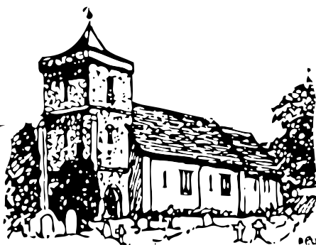
St. Mary's, Herriard