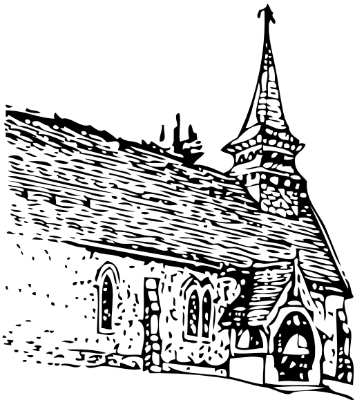
St. Lawrence, Westcott