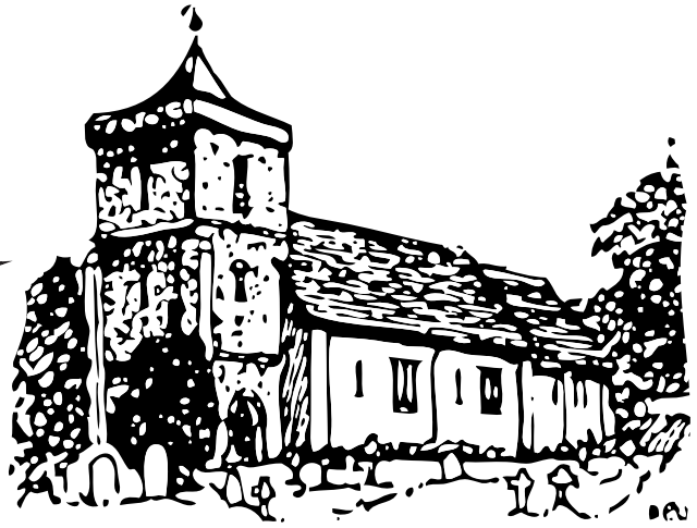
St. Mary's, Herriard