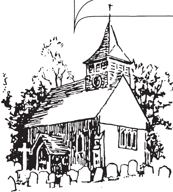
St. Andrew's, South Warnborough