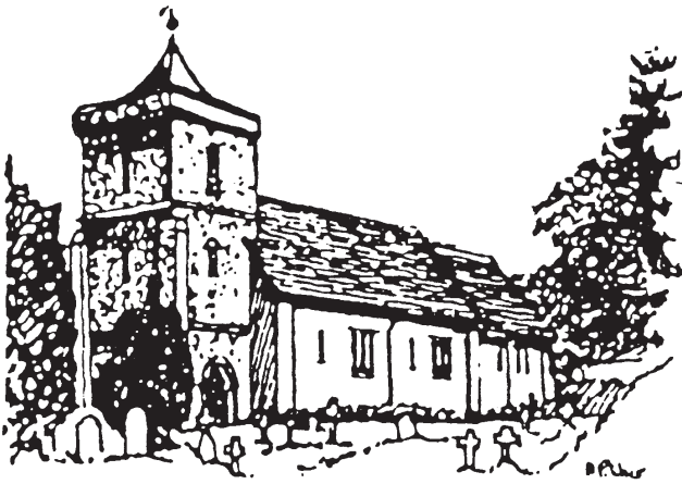
St. Mary's, Herriard