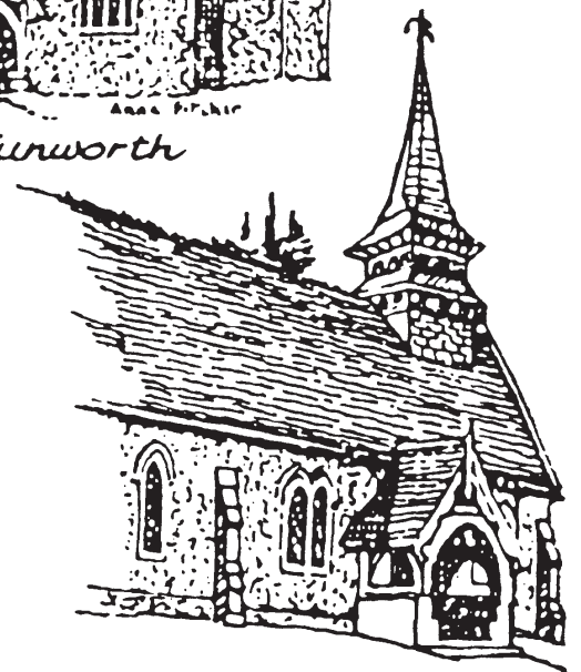
St. Lawrence, Weston Patrick