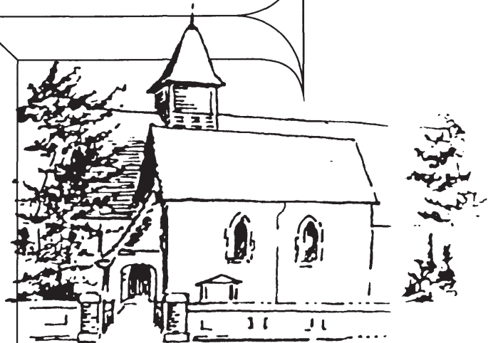
All Saints', Long Sutton