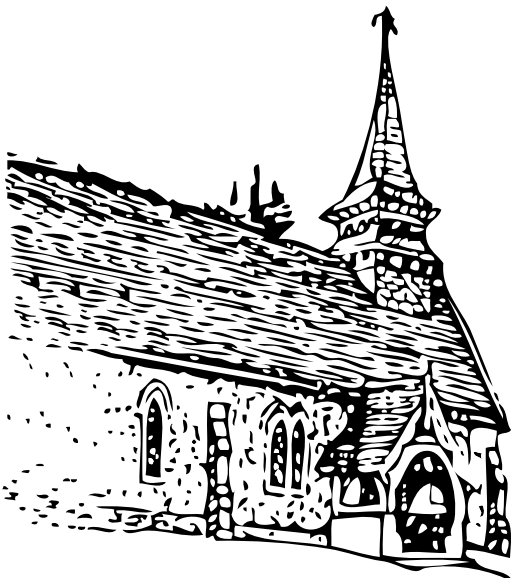
St. Lawrence, Westonzoyland