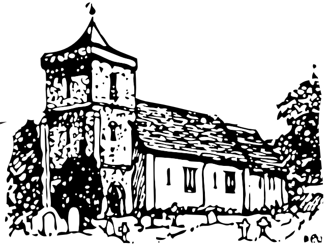
St. Mary's, Herriard