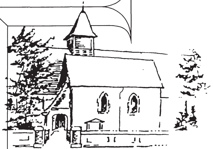
All Saints', Long Sutton