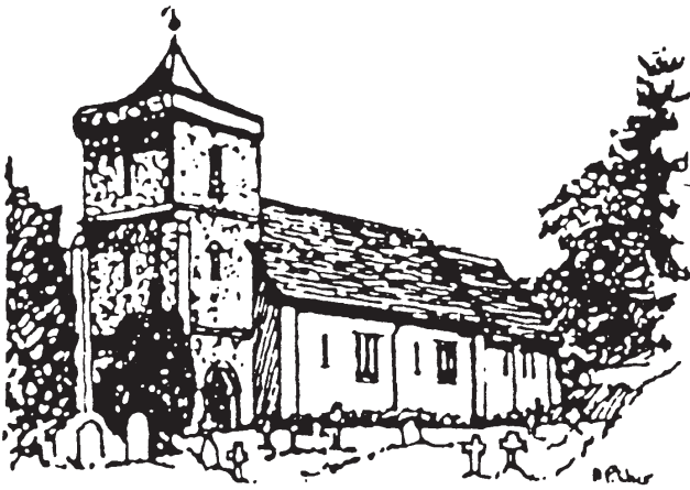
St. Mary's, Herriard