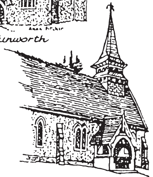
St. Lawrence, Weston Patrick