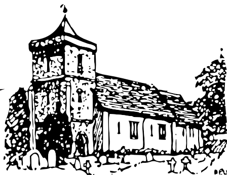
St. Mary's, Herriard