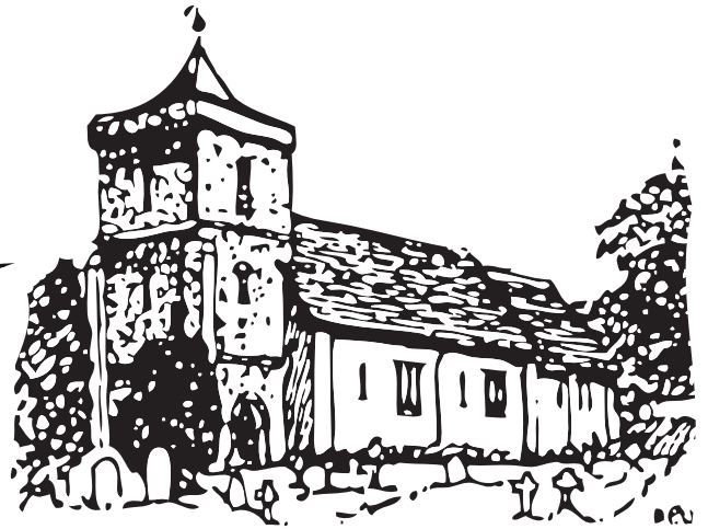
St. Mary's, Herriard