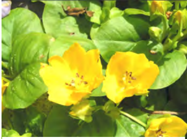
Creeping Jenny

roadsides, hedgerows and many other habitats. It is so common that it is often considered a weed. The Fat Hen flowers from June to October with spikes of whitish flowers rising from diamond shaped leaves. Before the introduction of spinach, it was often served boiled and buttered alongside meat. These days, it is considered a good food source for birds and insects. Fat Hen also goes by several other obscure names, including Bacon Weed, Dirty Dick, Goose Foot, Lamb's Quarters (USA) and Pig Weed.