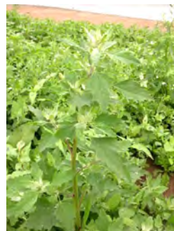
Fat Hen

A widespread and common plant with an amusing name is the Fat Hen ( Chenopodium album ). This plant grows in gardens, arable fields,