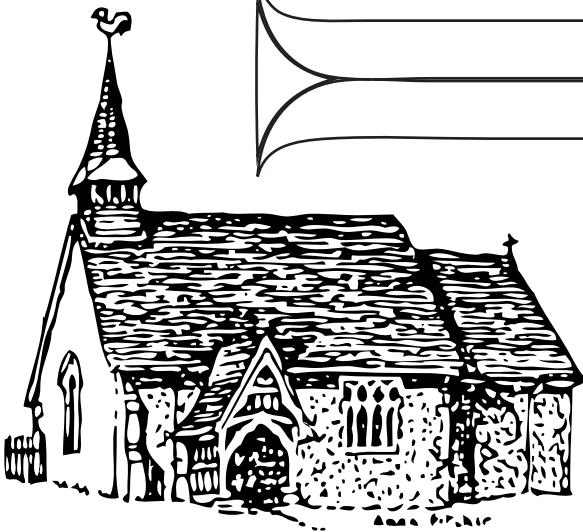
All Saints', Turworth