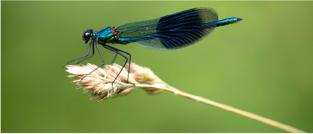
The banded demoiselle is a particularly striking damselfly

There are 17 species of damselfly and 23 species of dragonfly resident in the UK, plus the occasional visiting species from continental Europe.