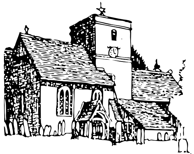
St. Mary's, Upton Grey