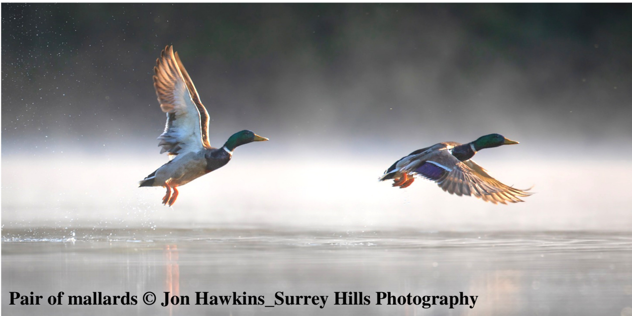
Pair of mallards

Winter into spring is a wonderful time to see wildlife, and birds especially. As the cold grip of Arctic winter takes hold on the lakes, pools and marshes of Northern Europe and Russia, huge numbers of swans, ducks and geese retreat to the relative warmth of the UK. The UK's lakes, rivers, reservoirs and coasts offer a winter home to an estimated 2.1 million ducks!