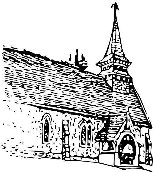
St. Lawrence, Weston Patrick