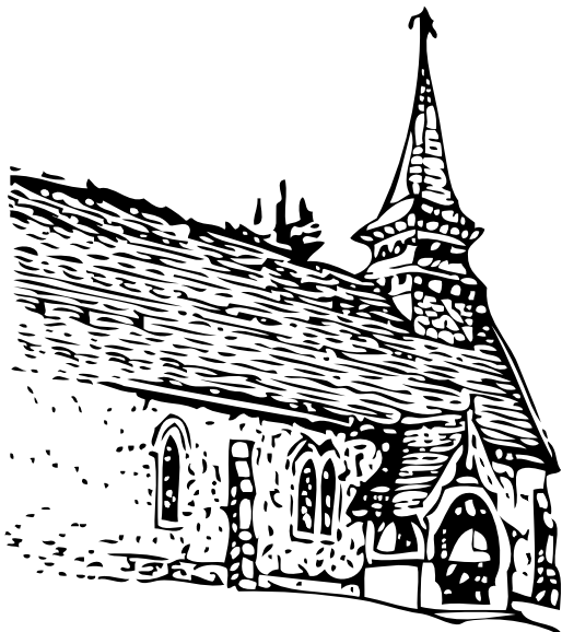
St. Lawrence, Weston Patrick