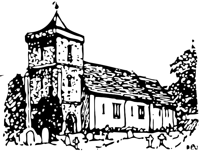
St. Mary's, Herriard