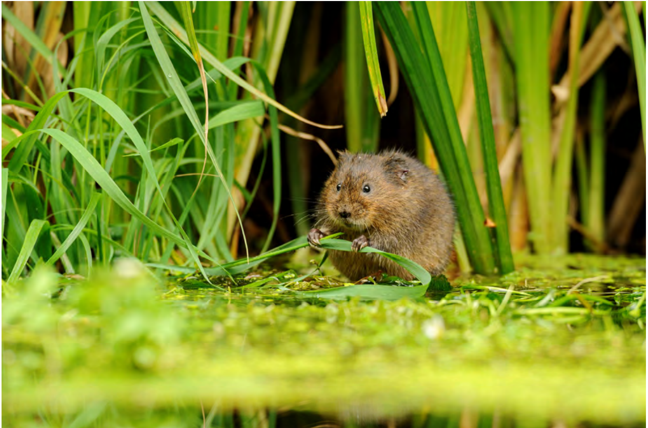
A water vole amongst reeds

Jake Kendall-Ashton Hampshire & Isle of Wight Wildlife Trust jake.kendall-ashton@hiwwt.org.uk 07469 85583