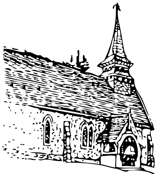
St. Lawrence, Westcott Parva