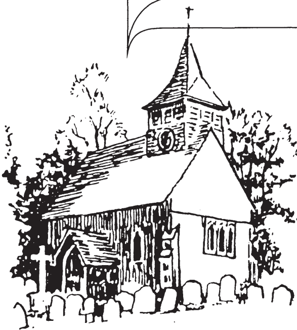
St. Andrew's, South Warnborough