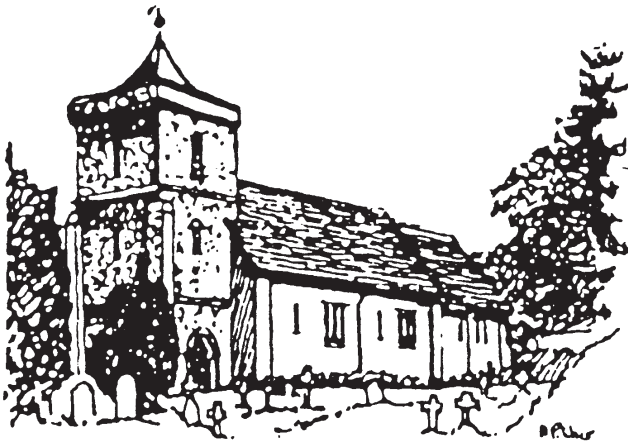
St. Mary's, Herriard