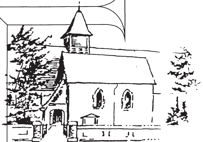
All Saints', Long Sutton